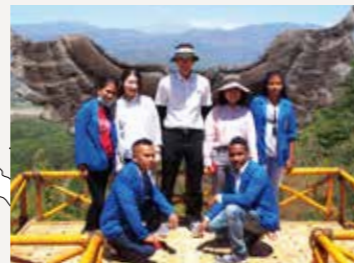
Program in Paz University