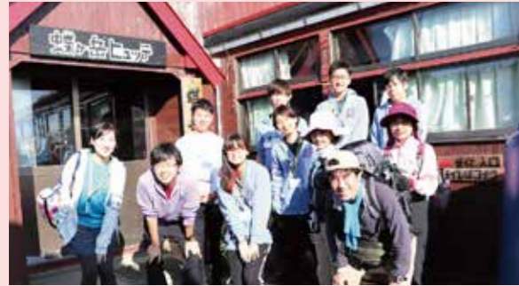
Mt. Cho Volunteer Medical Center