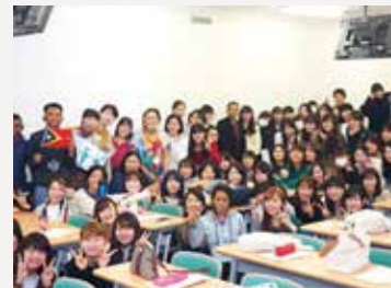
Joint class with international students