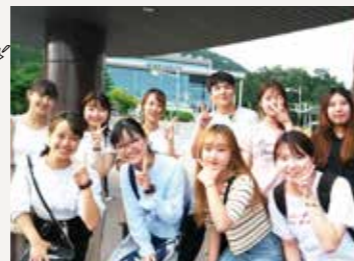
Program in Hallym University