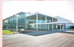
Faculty of Pharmaceutical Sciences