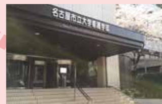
Graduate School of Nursing

■ The main goal of our education is to nurture nursing professionals who deeply appreciate the human dignity and can contribute to the health promotion, medical care, and welfare of people.