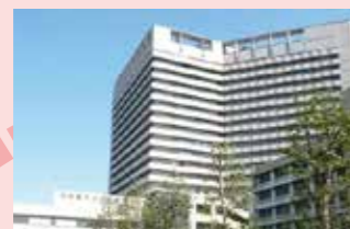
Nagoya City University Hospital