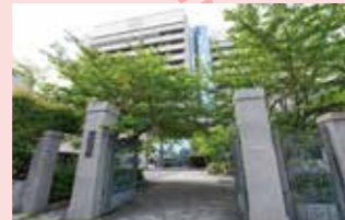
Graduate School of Medicine